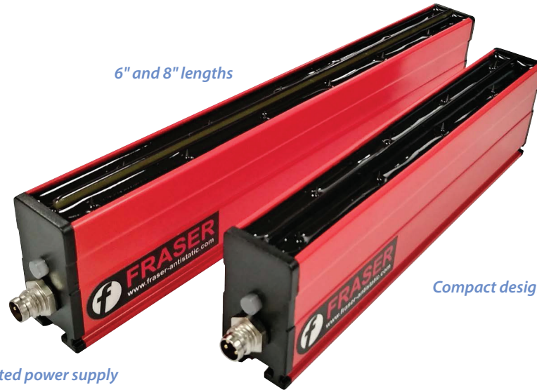
Integrated power supply